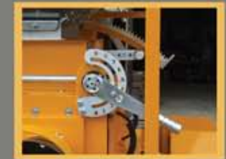
Feed Spreader Flap: Ensures a continuous even flow of feed.