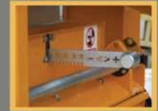
Adjustment made simple with the Unique Wakely Parallel roll gap adjustment lever.